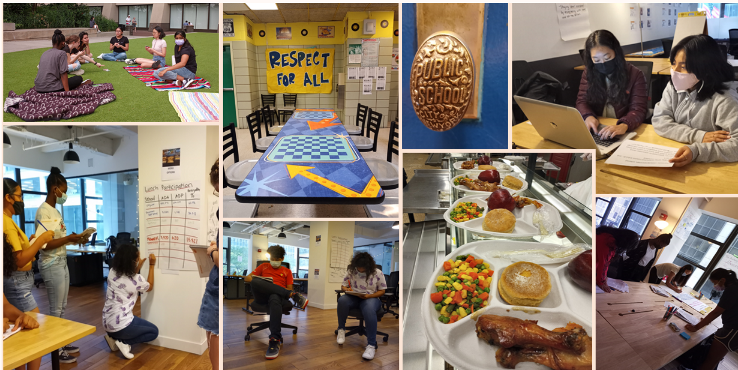
Cover Photos: YFA meets in person to work on YFA Menu Survey results & we visit school cafeterias to improve school food