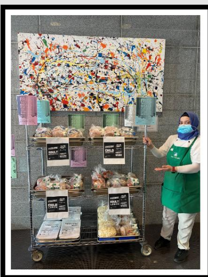
- Grab & Go, Meals, 2020

The COVID-19 pandemic has changed how we all work and live, and Youth Food Advocates is no exception. Before NYC school buildings closed in March 2020, we were hosted by one school building and worked to build partnerships within the five high school campuses in the building.